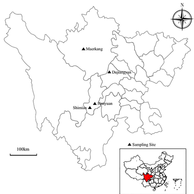
Figure 1. Locations of the sampled sites (filled triangle) in Sichuan Province, Southwestern China.

This study was performed in accordance with the recommendations of the Guide for the Care and Use of Laboratory Animals of the Ministry of Health, China. As only fecal samples collected after spontaneous defecation of forest musk deer were analyzed, this study did not require full Animal Ethics Committee approval in accordance with Chinese law. No animals were harmed during the sampling process. Permission was obtained from farm owners and managers before collection of fecal specimens.