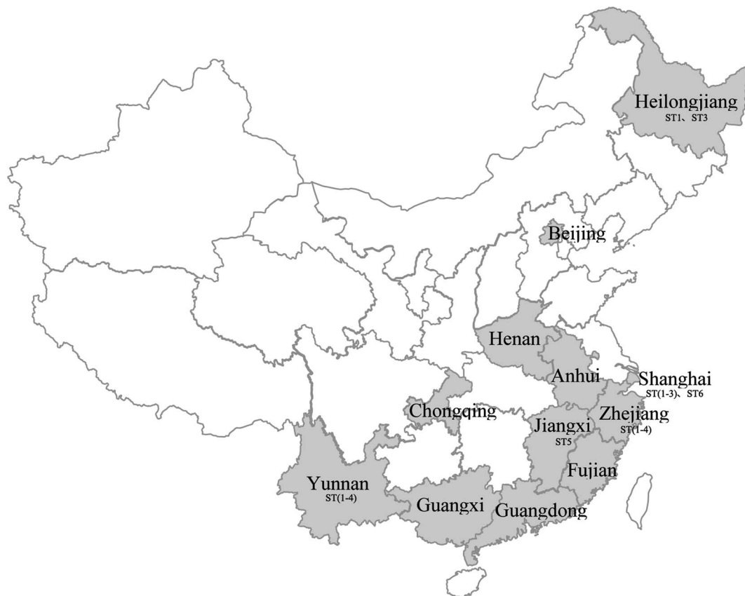
Figure 1. Prevalence of human Blastocystis in different provinces/municipalities in China.

Entamoeba spp., Giardia intestinalis , and Dientamoeba fragilis [49, 63]. Several studies have shown that contaminated water and food with a few number of Blastocystis cysts can establish an infection [17, 62]. Clinical presentations caused by this parasite are very diverse, ranging from self-limiting abdominal discomfort to chronic persistent diarrhea [33]. Frequently, these parasitic infections also present with dermatological symptoms, depending on the different Blastocystis subtypes [14]. Compared to healthy individuals, a higher incidence of Blastocystis has been observed in patients with diarrhea or other gastrointestinal symptoms, especially in patients with irritable bowel syndrome (IBS) symptoms [5, 18]. Since its first descriptions by Alexeieff and Brumpt [12], Blastocystis sp. has been found in a wide host range of animal hosts, including artiodactyls, perissodactyls, proboscideans, rodents and marsupials as well as birds, reptiles, amphibians, fish, annelids, and insects [31, 48]. Blastocystis sp. is included in the Water, Sanitation, and Health programs of the World Health Organization [58].