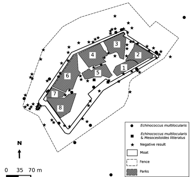
Figure 4. Location of negative and positive carnivore feces for Taenia spp. and Echinococcus spp.-DNA. Each park is numbered and harbored one species. 1: Eulemur fulvus ; 2: Eulemur macaco ; 3: Cebus capucinus ; 4: Macaca tonkeana ; 5 & 8: Macaca mulatta ; 6: Chlorocebus aethiops ; 7: Macaca fascicularis .

One hundred and thirty-eight fecal samples were collected inside the SPC or around the fence surrounding the center (Fig. 4). The search for E. multilocularis was positive in 20 samples (14.5%, 95% CI [8.6; 20.4]). Two samples were pos-