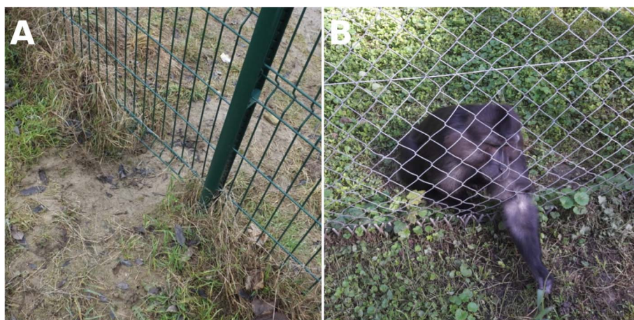
Figure 2. Two types of interaction between non-human primates and local wildlife. (A) Foxes ( Vulpes vulpes ) are able to dig passages under the fences of cages, and (B) non-human primates commonly look for food outside the fence, like this Tonkean macaque ( Macaca tonkeana ).

badger ( Meles meles ). There was no sample collection in NHP parks. Collection was limited to human passage areas.