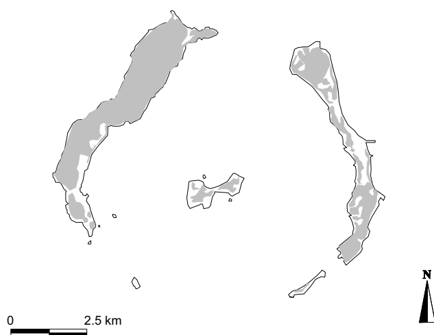
Fig. 4. – Distribution of the favourable habitats for G. p. gambiensis on Loos islands (obtained from Landsat 7TM interpretation).

ecology of G. p. gambiensis on Loos islands is very different from what is known in the West African humid savannah area, where they are mainly found in the riverine vegetation (Buxton, 1955; Bouyer et al. , 2005). Here, they show a two dimensional distribution versus a linear distribution in the humid savannah areas (Bouyer, 2006). During the dry season, tsetse appeared to be limited to the secondary forests, palm and mango-trees plantations which represented 72 % of the total surface (10.72 sq.km vs 14.83 sq.km) (Fig. 4). During the rainy season, tsetse may be found almost everywhere, with a relative hygrometry superior to 60 %, even in the drier areas.