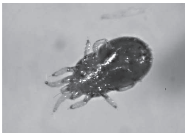
Fig. 1. – Gorged adult Dermanyssus gallinae . The chelicerae are visible.

On the one hand, the hematophagous ectoparasites, which are of particular interest to us as they can act as vectors, are mostly represented by the Dermanyssidae and Macronyssidae, which are principally parasites of birds and rodents and live in their nests and burrows. The Dermanyssidae are particularly well adapted as they are capable of feeding rapidly