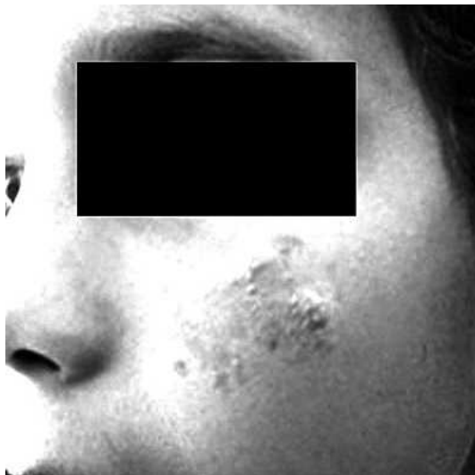
Fig. 4. – Satellite lesions at the periphery of the scar (Focus of Metlaoui).