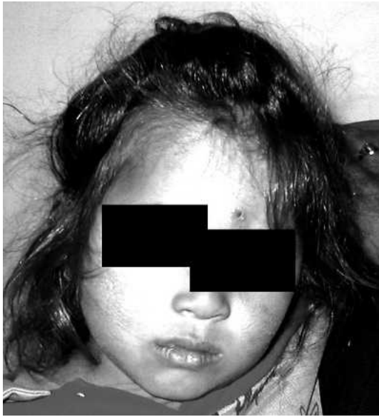
Fig. 2. – Small lesion, weakly infiltrated due to L. killicki .