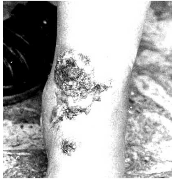
Fig. 3. – Inflammatory lesion of cutaneous leishmaniasis (Focus of Ain Jloula).