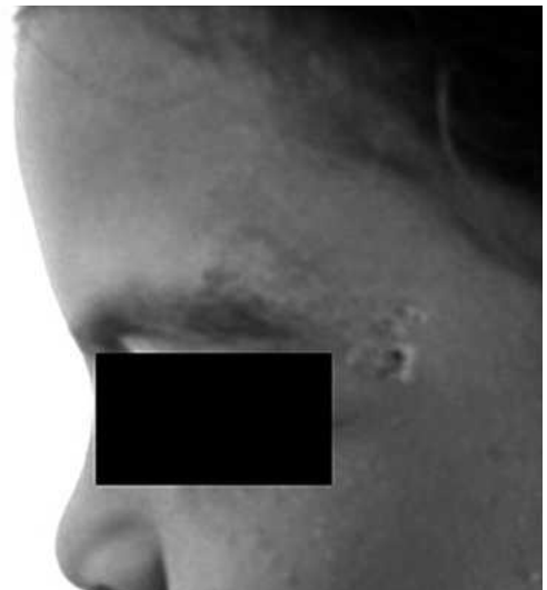
Fig. 5 – Dry face lesion due to L. killicki (Focus of Metlaoui).

tion, lasting frequently several years (Rioux et al. , 1986).